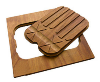
Chopping board (USA) 8644 034